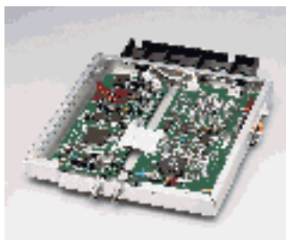
BKM-101C/102 Component serial digital interface kit 101C (video) / 102 (audio)

BKM-101C (Component serial digital interface kit (video)) BKM-102 (Component serial digital interface kit (audio)) BKM-103 (Serial remote control kit for RS422) SLR-103A (Slide rail) TU-1041U (Tuner unit)