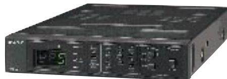
TU-1041U Tuner unit